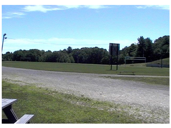
VIEW OF FIELDS, HP PARKING SIGNS